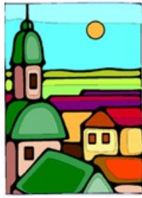
in the afternoon